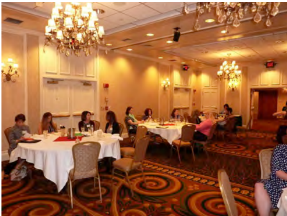
VPO's 2017 Annual Meeting and Conference - Lunch