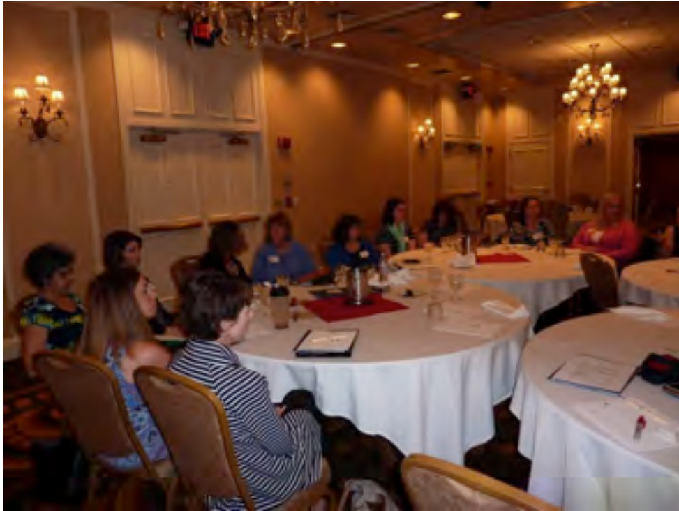
VPO's 2017 Annual Meeting and Conference – Roundtable Discussion