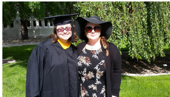
Little Sis Graduation in Reno, Nevada