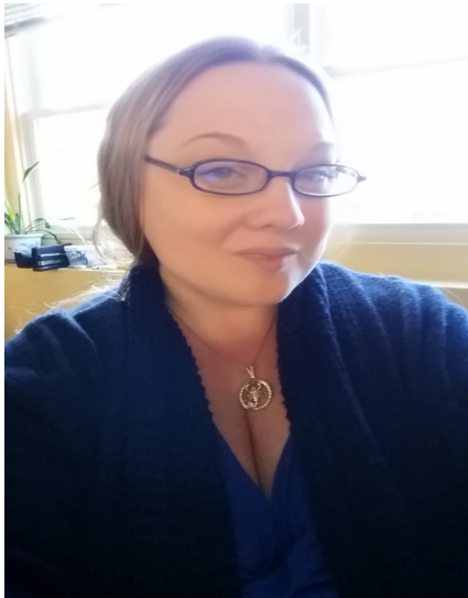
At the office in Montpelier, Vermont